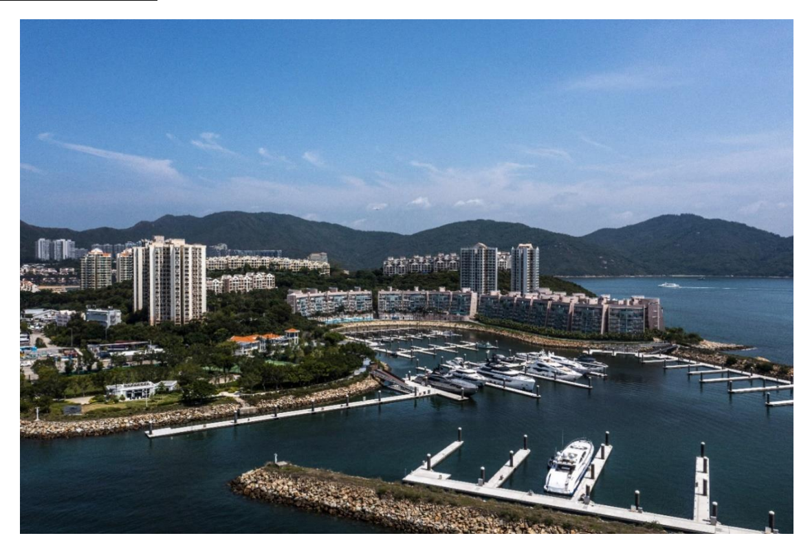
The 148-berth Lantau Yacht Club Marina is gradually filled up by superyachts.