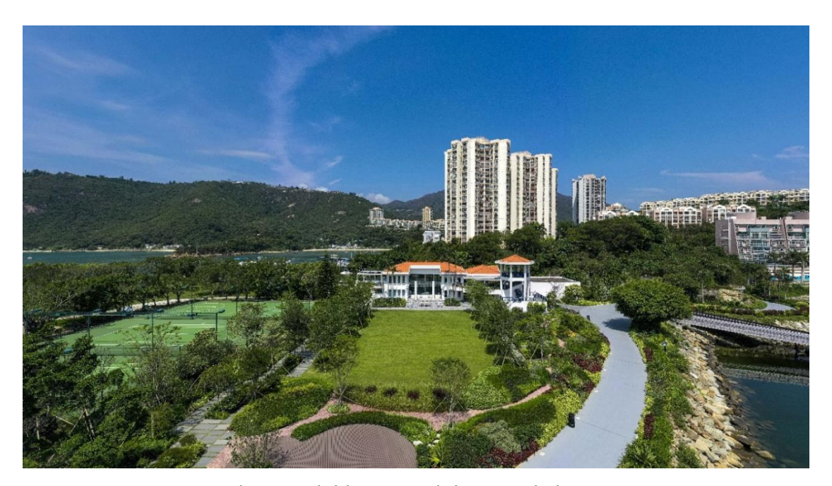
The LYC Clubhouse and the seaside lawn.