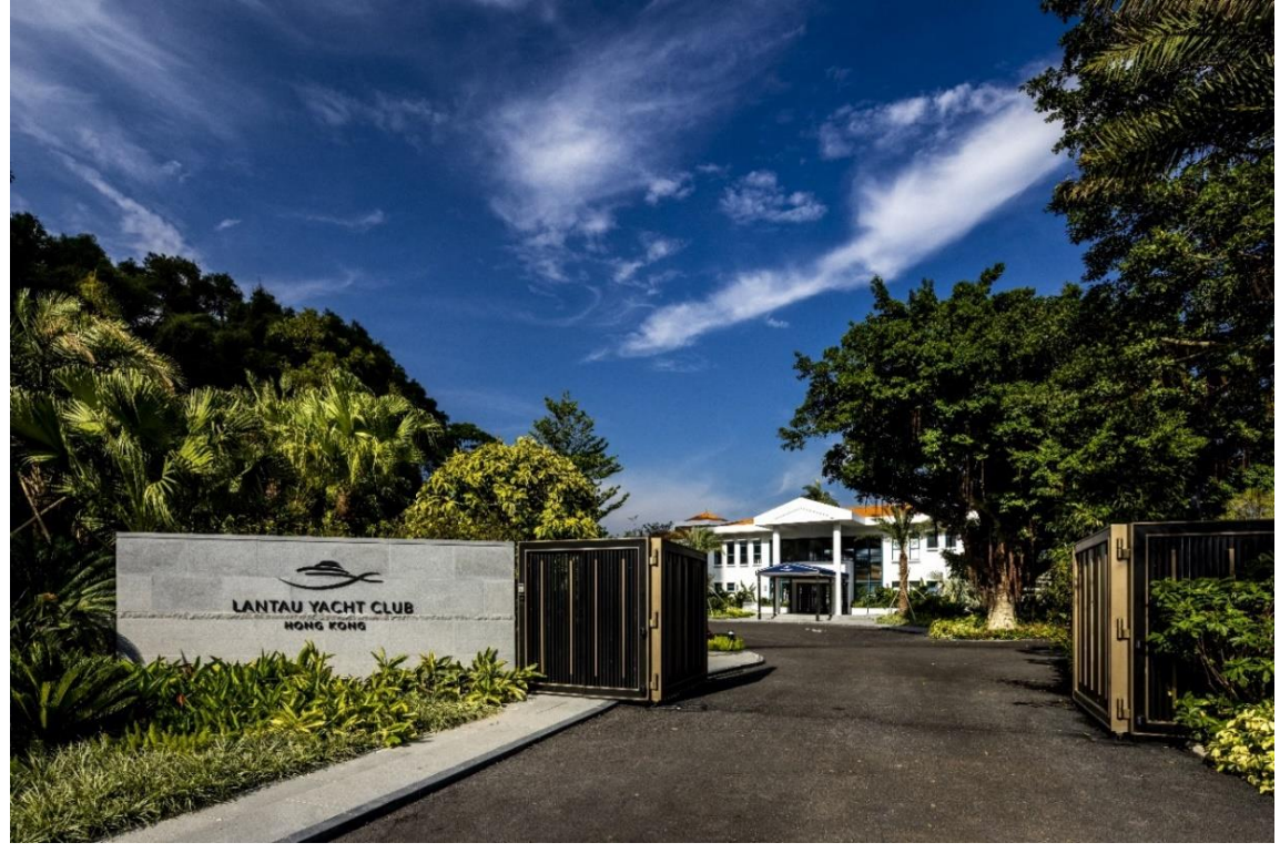
The refurbished LYC Clubhouse is now open to Members.