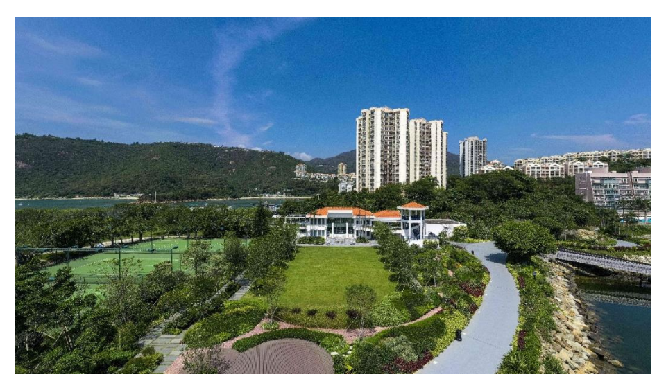
The LYC Clubhouse and the seaside lawn