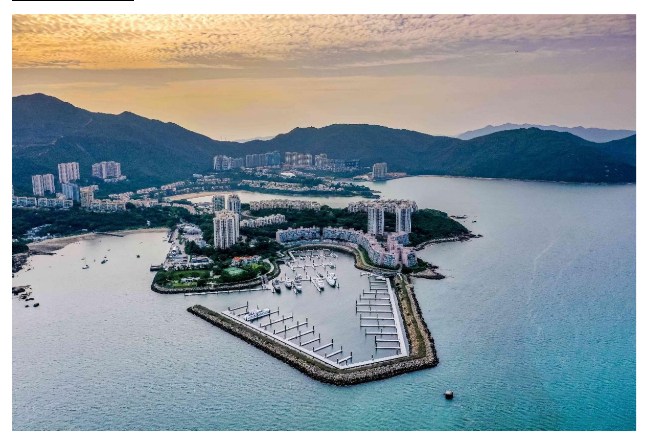
The LYC Marina boasts 148 berths ranging from 10 m - 60 m.