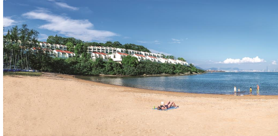
Left: Tai Pak Beach Lower Left: D'Deck Lower Right: Spa Botanica at Auberge Discovery Bay