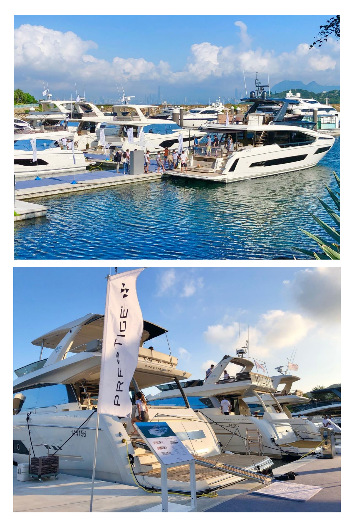
Prestige Exclusive Day & Asia Yachting Brokerage Boat Show in November 2021