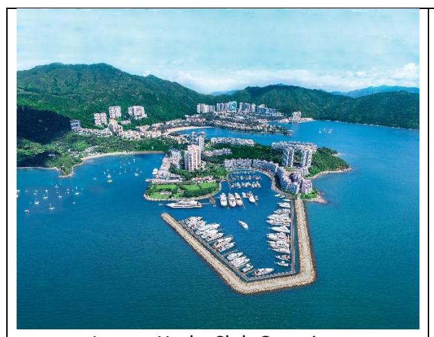
Lantau Yacht Club Overview

Please download high resolution images from this link: Hi-res images