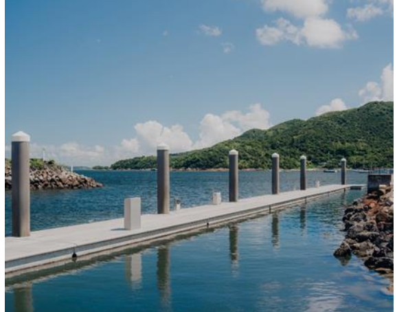
Hong Kong's One-and-only 100-metre Superyacht Berth

This press release is issued by Lantau Yacht Club.